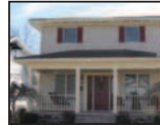
Bill & Vicky Beckstedt 611 Cherry Street