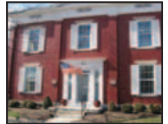
Reed Mote Staley Insurance, Inc. 500 N. Wayne Street